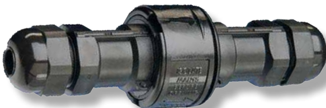
QUICK CONNECT PLUG FCN-16260 3P