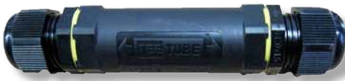
IN-LINE JOINER FCN-16250