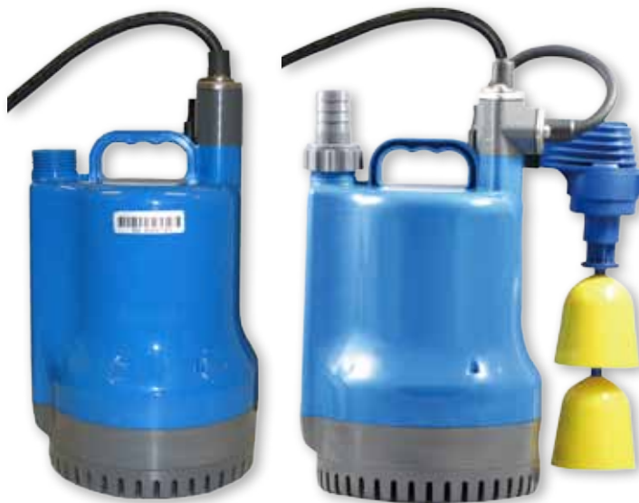
ECO M SERIES