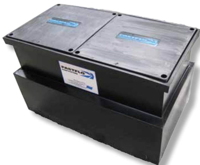
MAXI (DUAL) 720 x 1270 x 770 H (500Ltrs max)